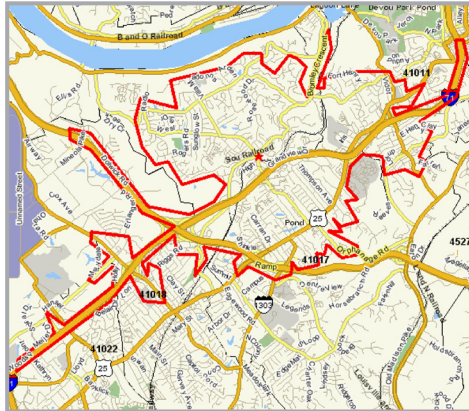
Five minute drive time map